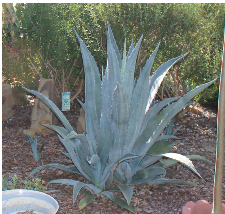
Agave Americana Century Plant

Type: Succulent Watering Needs: Low Light Needs: Full Sun Maintenance: Low Height: 3 - 6 ft Space: 6 - 10 ft Bloom: N/A CA Native: No